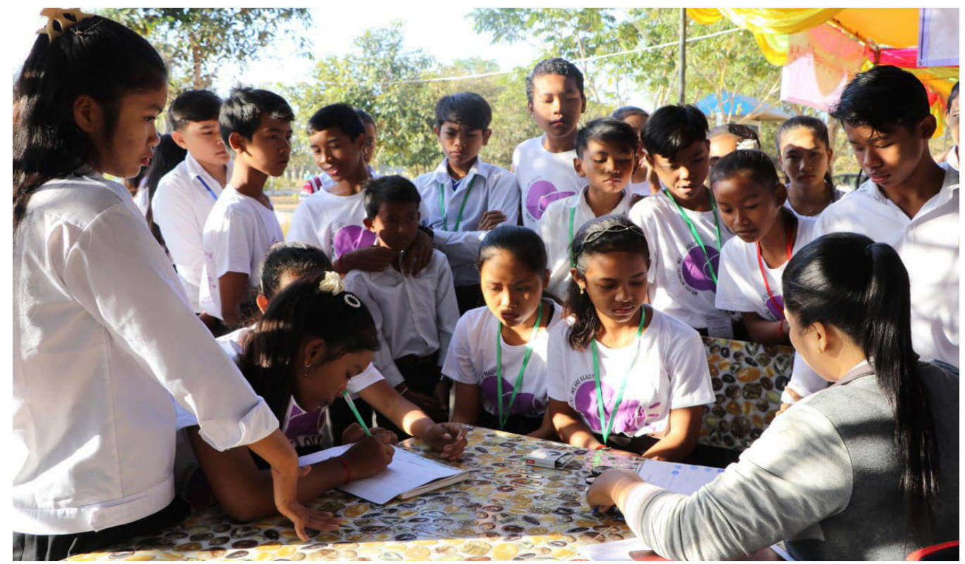
Girls and boys develop positive, healthy relationships through the guidance of Gender and Development for Cambodia (GADC).